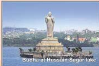
Budha at Hussain Sagar lake