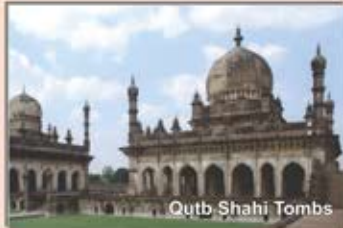
Qutb Shahi Tombs