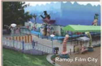
Ramoji Film City