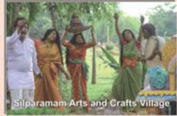
Silparamam Arts and Crafts Village