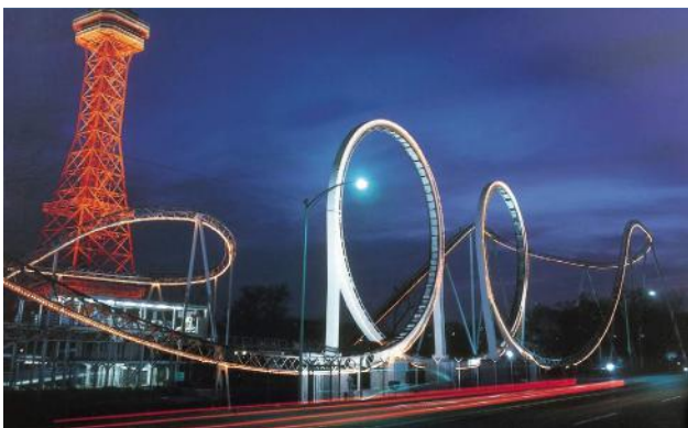
Six Flags Park Texas