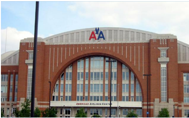
American Airlines Center