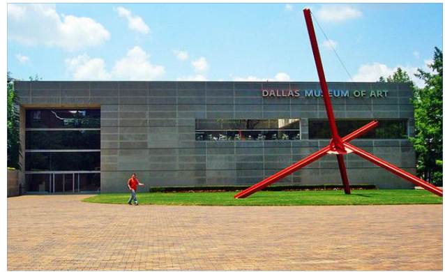
Dallas Museum of Art