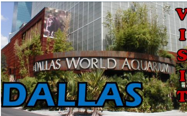
Dallas World Aquarium