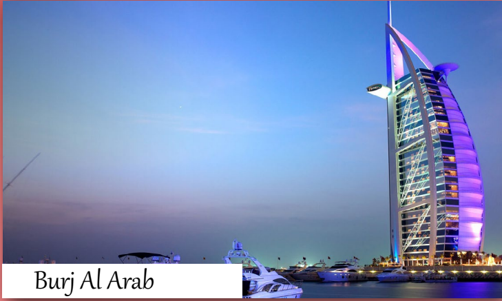
Burj Al Arab